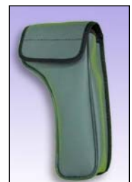
Carrying Case (optional)

* Note: This thermochecker is only for monitoring forehead temperature and should not be used to judge a fever.